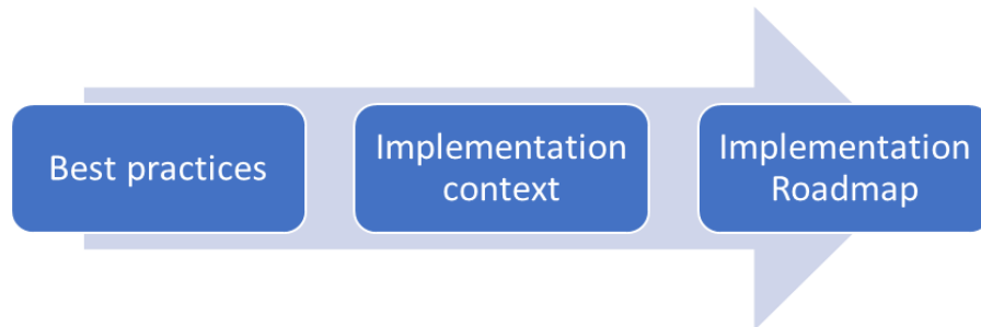
Figure 2 Implementation of roadmap

Best practices and the implementation context significantly influence the roadmap for joint services. Detailed discussions on these aspects are provided in section 2.4. The EC's Pact4Skills, launched in 2020, aims to support organizations with upskilling and reskilling for thriving through the green and digital transitions.